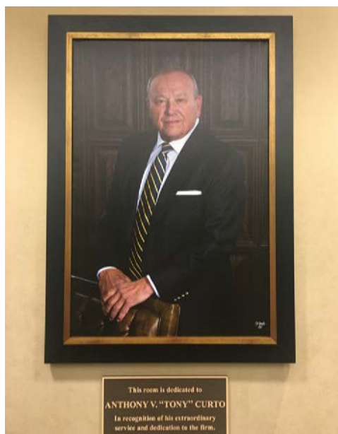
The Firm dedicated a conference room and renamed it as the new Anthony V. Curto Boardroom.